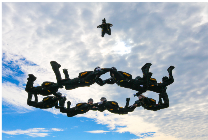
Members of the Eight Way Competition Team perform winter training over Laurinburg, North Carolina.

This once-in-a-lifetime experience demonstrates the great capability, 'first hand' and reiterates to our young citizens the many opportunities available to them. Those who have jumped with the tandem team include: the 41st President of the United States, George Herbert Walker Bush, Geraldo Rivera, Chuck Norris, Bill Murray, the cast members of the TV show "The Unit," Dennis Haysbert and Robert Patrick and New Orleans Saints, quarterback Drew Brees to name a few.