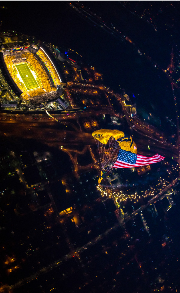
Members of the Demonstration Team fly the American flag and night pyrotechnics into Pittsburgh Steelers Stadium, Heinz Field.

Millions of people throughout the world see the Golden Knights each year, at over 70 demonstration sites across the nation and abroad. These Army Ambassadors perform precision free fall demonstrations to connect the US Army with people in towns who rarely, if ever, see a Soldier. These men and women, of the Black and Gold demonstration teams, tell their Army story to all they meet to increase the propensity to join the all volunteer force. Preparation for the demonstration itself begins hours prior to the performance. The Aviation Detachment (Team Six) prepares the aircraft for takeoff, smoke is rigged, flags packed, weather checked and media briefs are given to the media riders by the designated safety demonstrator. The C-31A Friendship Fokker or the C147A Dash 8 takes off 30-40 minutes prior to time on target. The flight pattern is established, black and gold wind drift indicators are dropped and they climb to altitude.