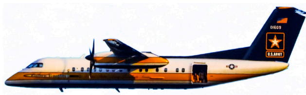
Here the Team proudly displays their newest member of the fleet, the C-47a (DHC-8 315).

The full show consists of four separate maneuvers, which demonstrate the maneuverability of the human body while falling at speeds in excess of 120mph, which can be altered due to weather or other concerns, once again displaying amazing talent and flexibility of the team.