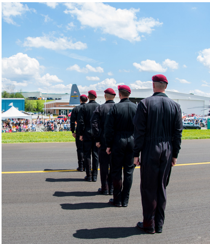
The Team lines up for introduction at the end of the airshow performance.

The hundred and two men and women who make up the Golden Knights are separated into eight sections - The Black and Gold demonstration teams, a tandem team, two competition teams, a select training team, an aviation detachment and the headquarters section.