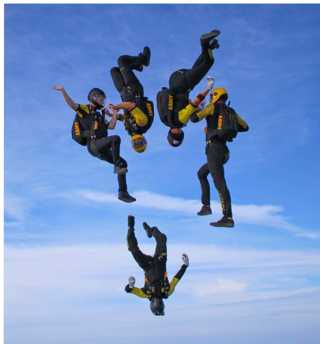
Members of the Vertical Formation Skydiving Team, (VFS), train over Homestead ARB, Florida.

The Golden Knights Competition Team participates in several categories; accuracy, free-fall formation, canopy piloting, canopy relative work, free flying and vertical relative work. Not only are the Golden Knights superb competitors, they are true sportsmen.