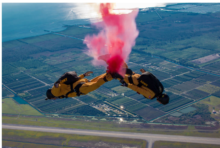
Members of the Black Demonstration Team break off from a Baton Pass over Homestead ARB, Florida.

The Team has increased its support of the operational force for military freefall Soldiers with personalized coaching and assistance in maintaining and improving military freefall infiltration skills and techniques, while preparing for deployment and rotating teams in support of the Special Operations Headquarters.