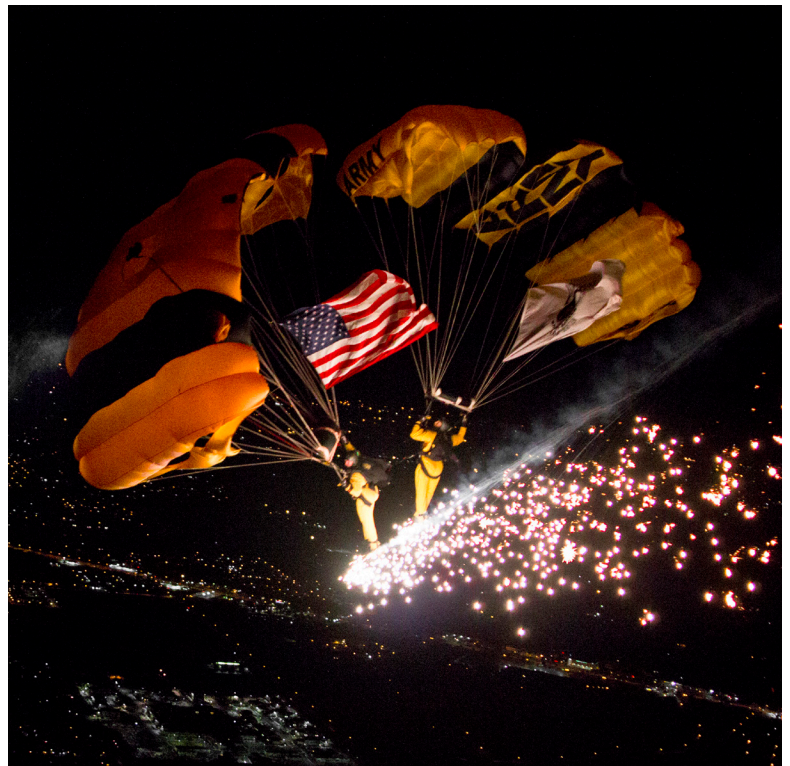
Members of the Army Parachute Team display a Pyrotechnic side by side formation during winter training.

The Headquarters section enables the demonstrators and competitors the flexibility to concentrate on putting on phenomenal shows and bringing home gold medals. Headquarters elements control the logistics and support for the team. These duties include show scheduling, military schools, waivers, personnel records, evaluations, leave and travel orders, uniforms, equipment contracts, maintenance, parachute maintenance, repair, reserve parachute repacks and inspections, Media Relations/Public Affairs, local and national media, Office of Chief of Public Affairs, media coordination, graphic illustrations, photography, lithoes, video shooting, editing and production and budget.