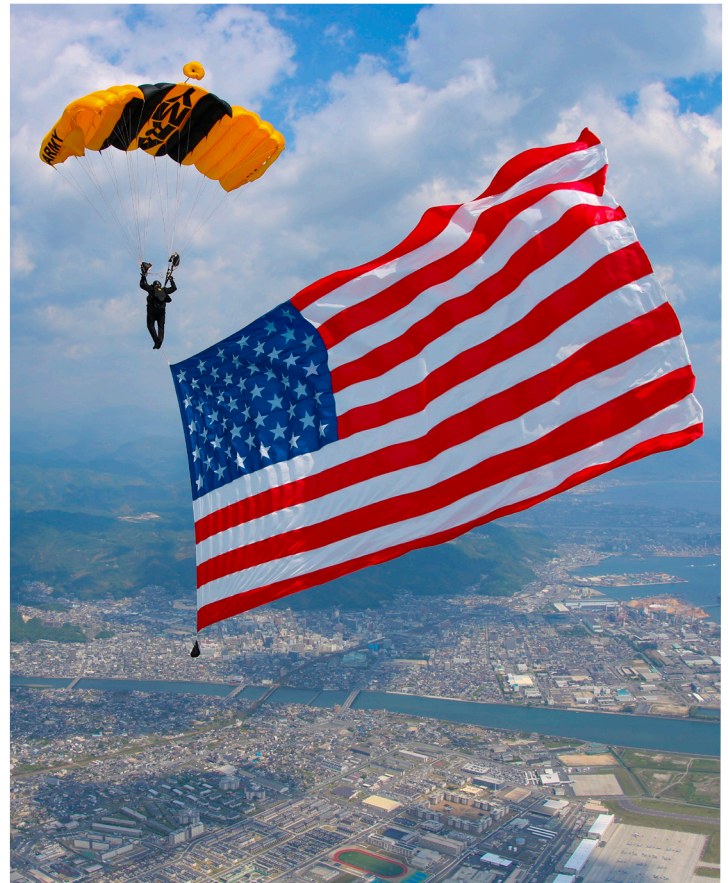
Black Team flies the American Flag to the target at Marine Corp Air Station, Iwakuni, Japan.

1961 the team had a meeting to select a team nick name and they chose “the Golden Knights.” On October 15, 1962 the team confirmed the nickname the “Golden Knights” on the competition field of battle. Golden, signifying the gold medals the team had won; Knights, proving that they were world champions and had “conquered the skies.”